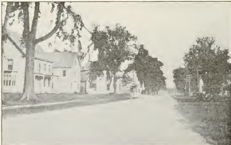
Main Street, North Windham, Maine